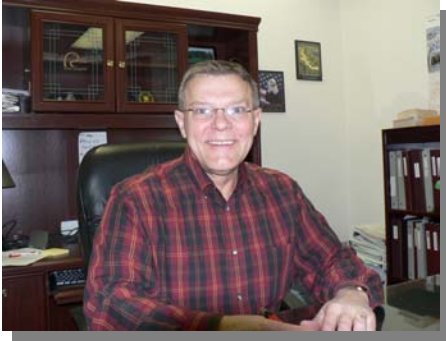
By Jim Peterson

I want to thank all of you for your patience with us in the office as we work through the process of replacing your hard copy Safety Manuals with a CD-ROM (we are now 80% done). The CD-ROM will contain all the essential elements of your current Safety Manual. As we convert your Safety Manual/Safety Programs to a CD-ROM we will change the format, but more time consuming than that is time spent improving and improving the content to make your programs not just more user